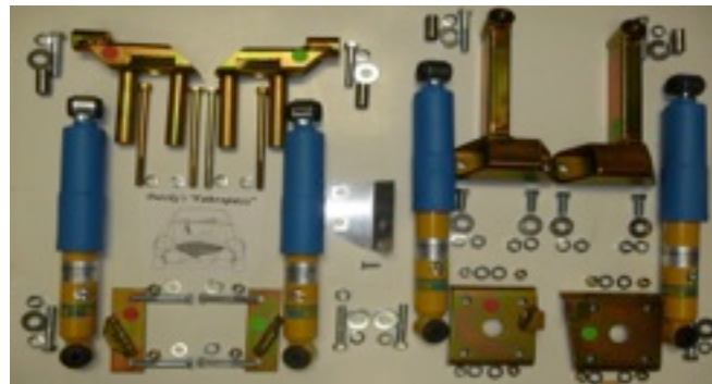
Drive your HEALEY safer, more comfortable and controlled!

Shock absorber conversion kits for Big Healeys $ 899/$ 949 (BJ8 Ph2) Bugeye Sprite $ 650/$ 690 Jensen-Healey $ 435 (2 front & 2 rear shocks)