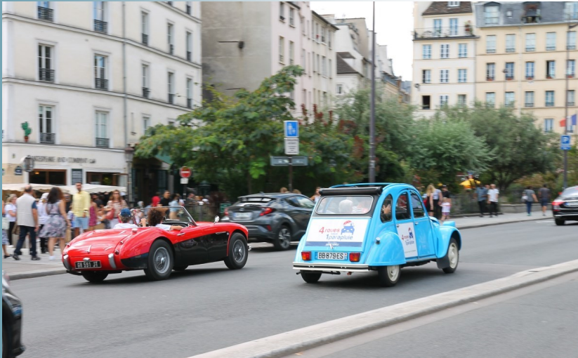
Above: Who wouldn't love to drive a Healey in Paris?