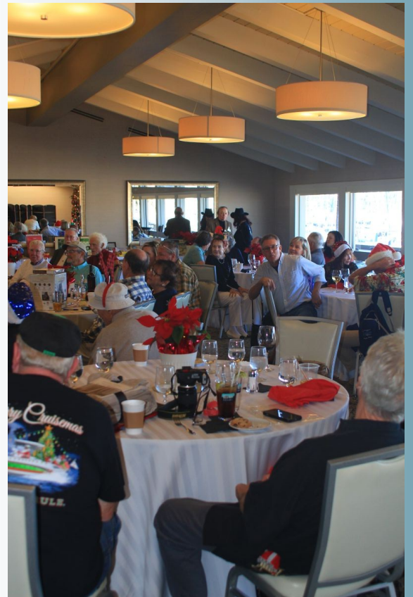
Above: Everyone enjoying the festivities