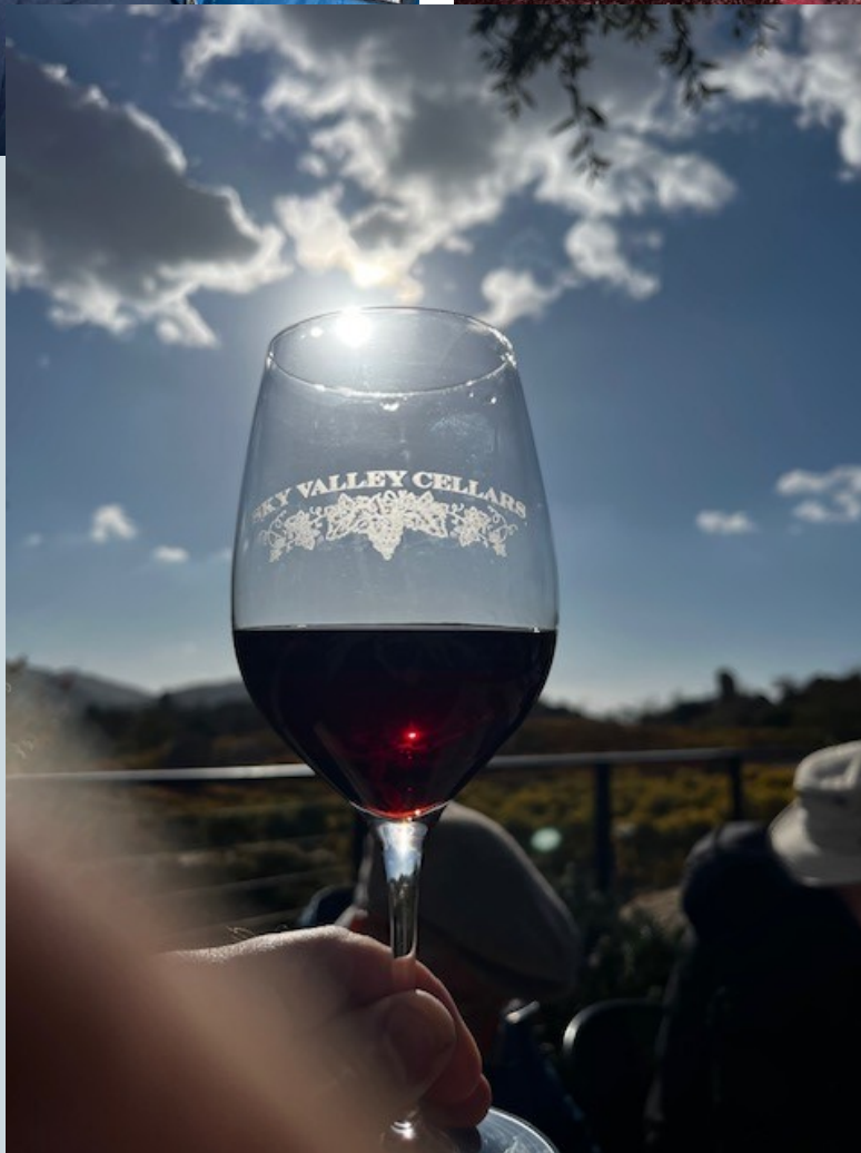
Right: A toast to the sun, which we could have used more of!