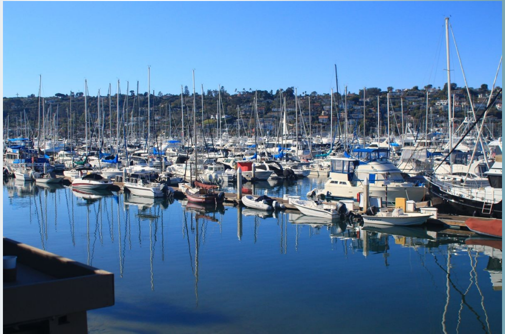
Above: Beautiful venue, beautiful day