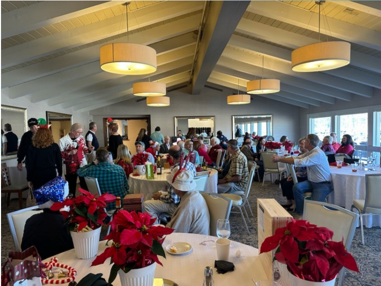
Above: Everyone enjoying the festivities