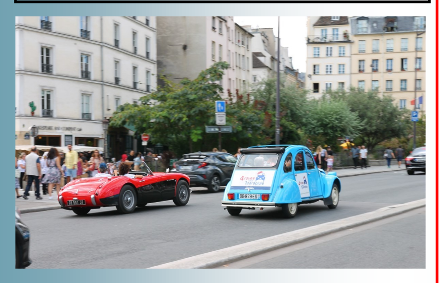
Above: Who wouldn't love to drive a Healey in Paris?