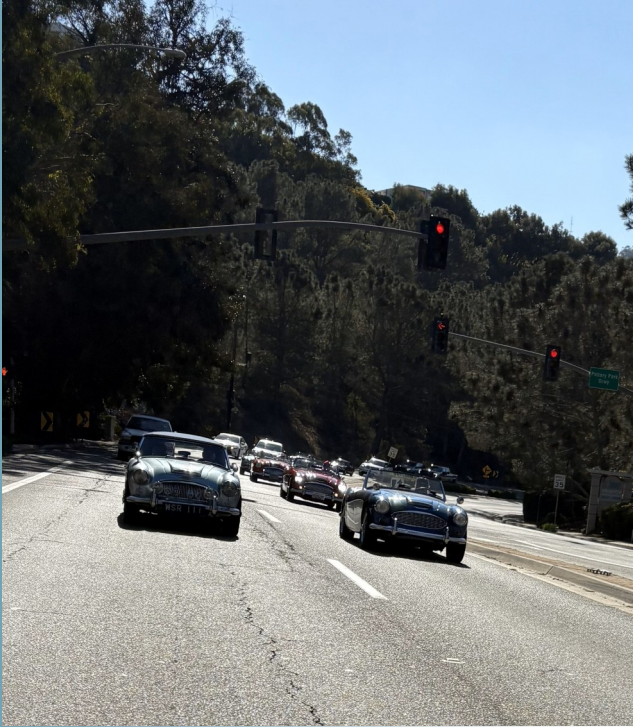
Heading up the hill.