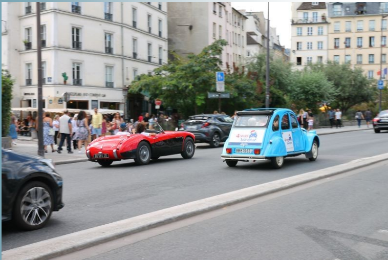
Above: Who wouldn't love to drive a Healey in Paris?